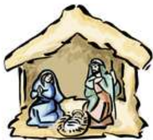
The Gift that Changed the World

How Do I Feel Loved? - Continued from Page 1