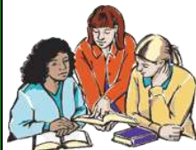
Women's Bible Study