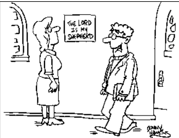
“That's why I say, 'Fleece Navidad!'”

Districts has 43 people signed up to go! (10 adult chaperones and 33 students). Pray for safe travels and a life-changing, spiritual experience for everyone.